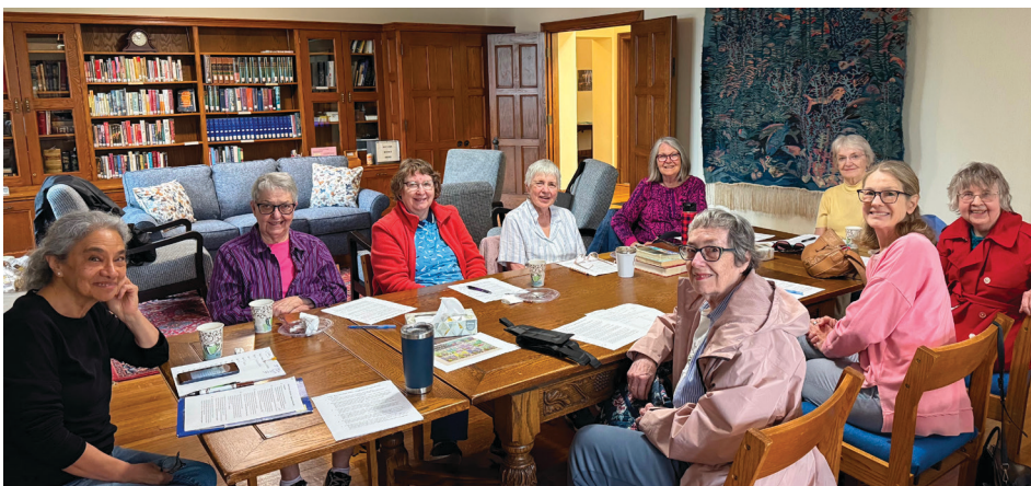
Members of the Women's Book Group enjoy meeting in the newly refurbished library.