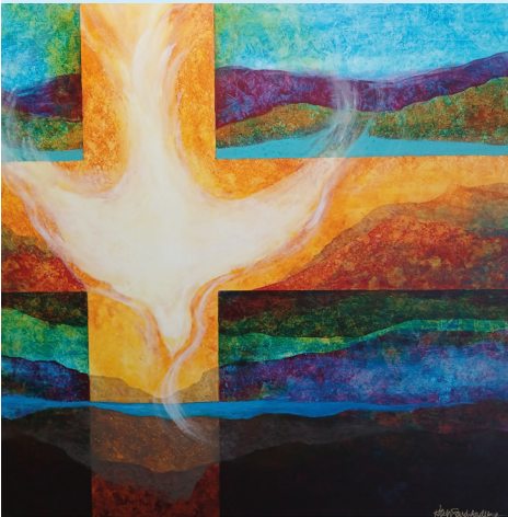
Water & Spirit