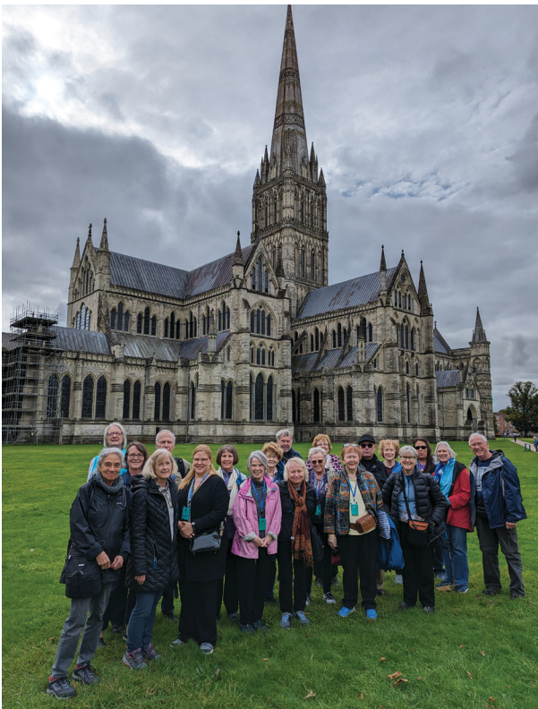
English Pilgrimage: Bath - London and Beyond October 1-9

The House of Hope Presbyterian Church is a Covenant Network Congregation.