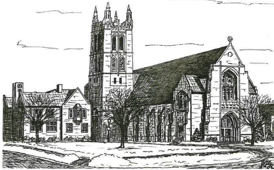
Drawing by John A. Goodding

Peace Candle. The single candle near the pulpit is our Peace Candle, lighted as a reminder of the ongoing need for our prayer for peace in the world.