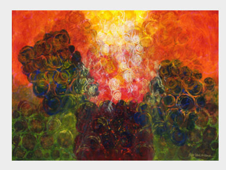
O Cornerstone, an interpretation of Arvo Pärt's Magnificat & Sieben Antiphonen.