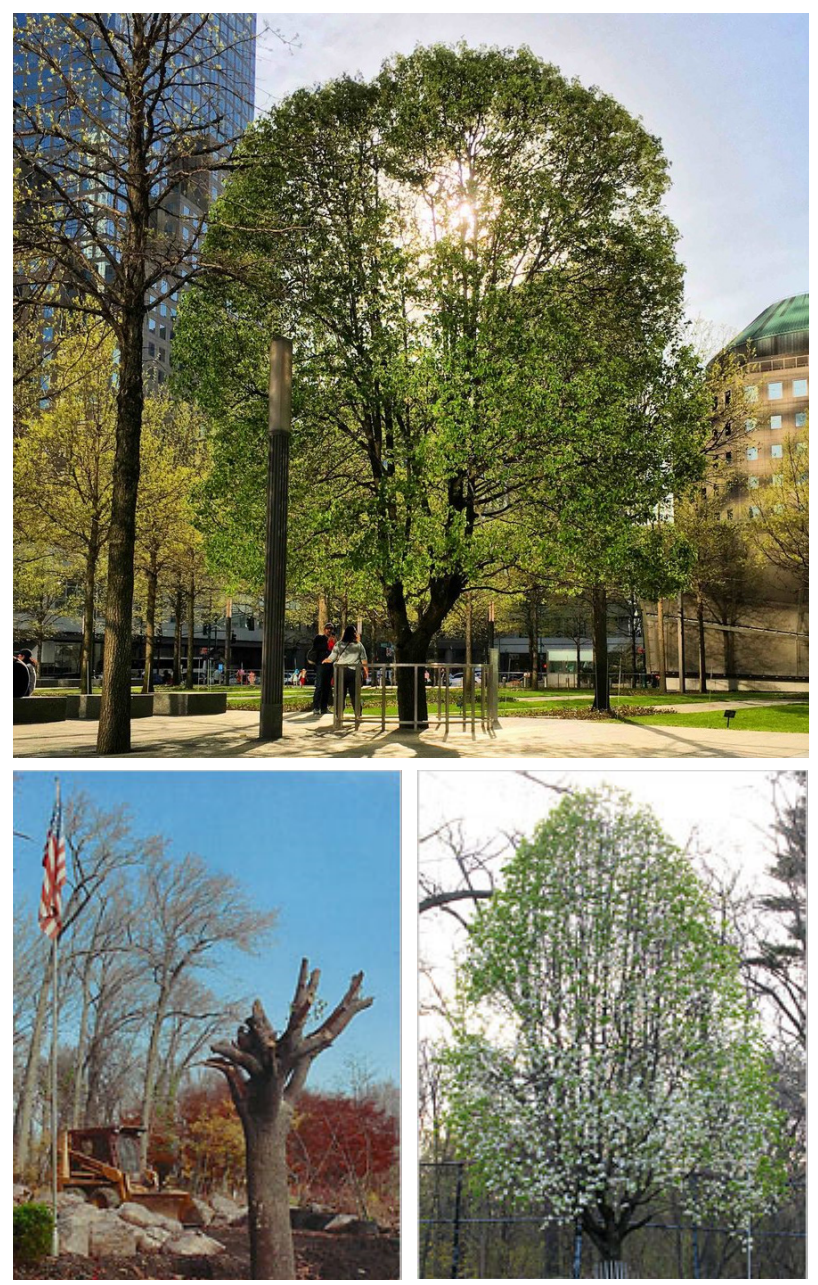
Easter Sunday | April 4, 2021 10 a.m.