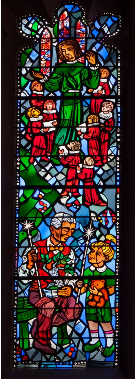
Thomas Tallis Maurice Ravel