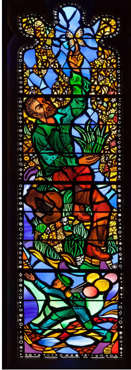
Walt Whitman E.E. Cummings