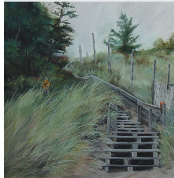
Closed Area: Whitefish Dunes State Park Acrylic, 40" x 40"