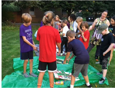
Tweens working together on an outdoor art project.