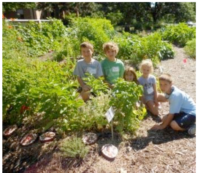
Sunday School children created pizza-like stepping stones for the children's section of the garden. The children voted to have their section be a pizza garden.