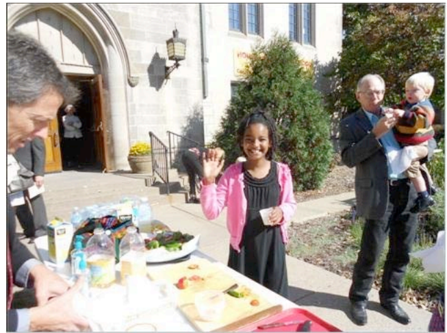
Sunday School Pizza Party!

Last May, the Sunday School children voted to have their section of The House of Hope Community Garden be a pizza garden, and a pizza party was promised at harvest time. Well, the growing season ended a bit early, but the pizza party was held and it was a great success! Cheese pizzas were provided, and children and adults were encouraged to cut up tomatoes and peppers that came from the garden. We gathered by the garden on Sunday, October 2, in beautiful sunshine, and celebrated the wonders of creation and the good things that come from God's earth.