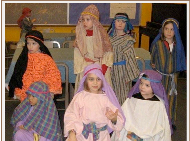
The Children's Christmas Pageant

The third annual CHILI CONTEST will be held on Sunday, January 30, in the Great Hall. Start looking for your own special recipe and watch for details!