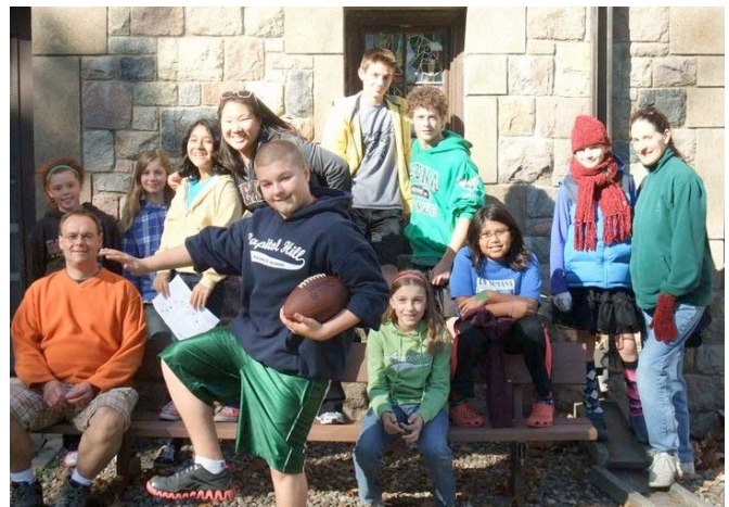
Middle School Retreat

This past October, nine youth and four adults trekked up to Presbyterian Clearwater Forest for their annual Fall Middle School Retreat. We joined several Presbyterian youth from around Minnesota to fellowship, worship God and learn about the value of Encouragement in today's world. We had a wonderful time building relationships and enjoying nature, and we encourage all middle school students to attend next year!