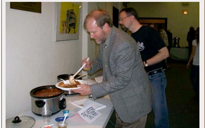
A scene from the Great Chili Cook-off